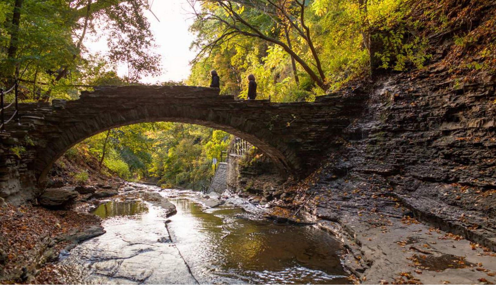
Students on Cascadilla Creek Bridge in the fall - the iconic bridge on Cornell's Cascadilla Gorge Trail.

The mission of the Cornell Institute for Healthy Futures is to provide a multidisciplinary platform for integrating hospitality, health management/policy, and design to enhance service excellence in healthcare, wellness, senior living, and related industries.