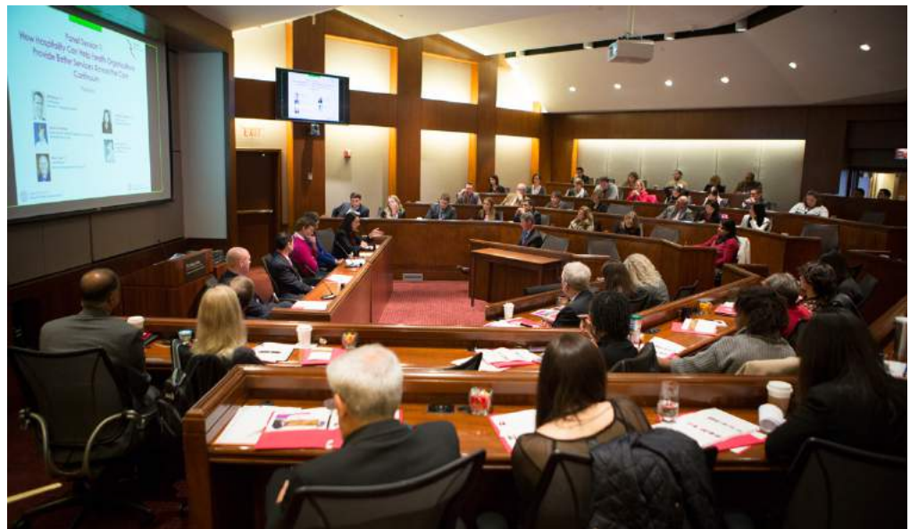
Attendees at the CIHF Inauguration, 2015

It is hoped that by combining insights from industry leaders, faculty and students that some concepts may emerge for more innovative ways of applying ideas from hospitality services to a variety of settings across the healthcare continuum.