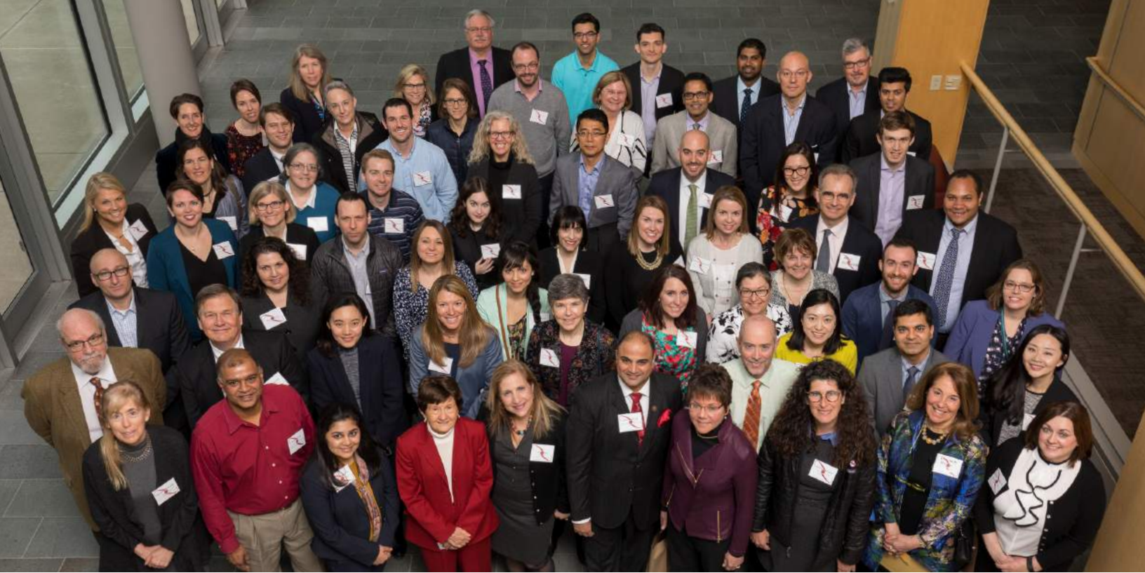
Participants from 2018 CIHF Mini-Symposium

Taylor Rooms A + B, Taverna Banfi, Statler Hotel