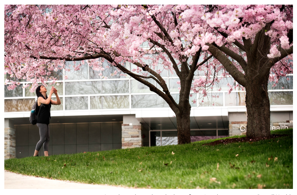
A student takes a closer look at a flowering cherry tree near Cornell Health

After lunch, working groups made up of industry leaders, faculty and students, facilitated by the morning's presenters will focus on critical topics such as future research, translating research into practice, education, policy and establishing the business case. Through these collaborative working groups, we can set an agenda for future action in the intersecting fields of nature, health and wellbeing.