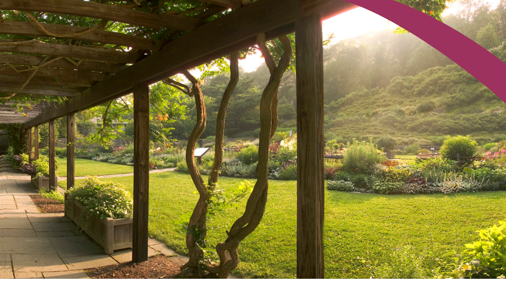
Viewing the Robison Herb Garden from under the pergola at the Cornell Botanic Gardens

The mission of the Cornell Institute for Healthy Futures is to provide a multidisciplinary platform for integrating hospitality, health management/policy, and design to enhance service excellence in healthcare, wellness, senior living, and related industries.